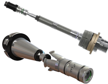
Tool Clamping Solutions & Spindle Shafts