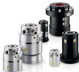
Sitema® Safety Solutions