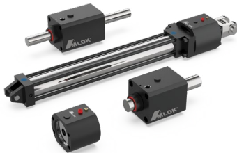
AMLOK® Rod Locks