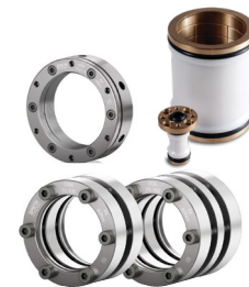
Machine Design Components