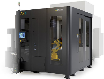
Automated Pallet Systems & Robot Machine Tending